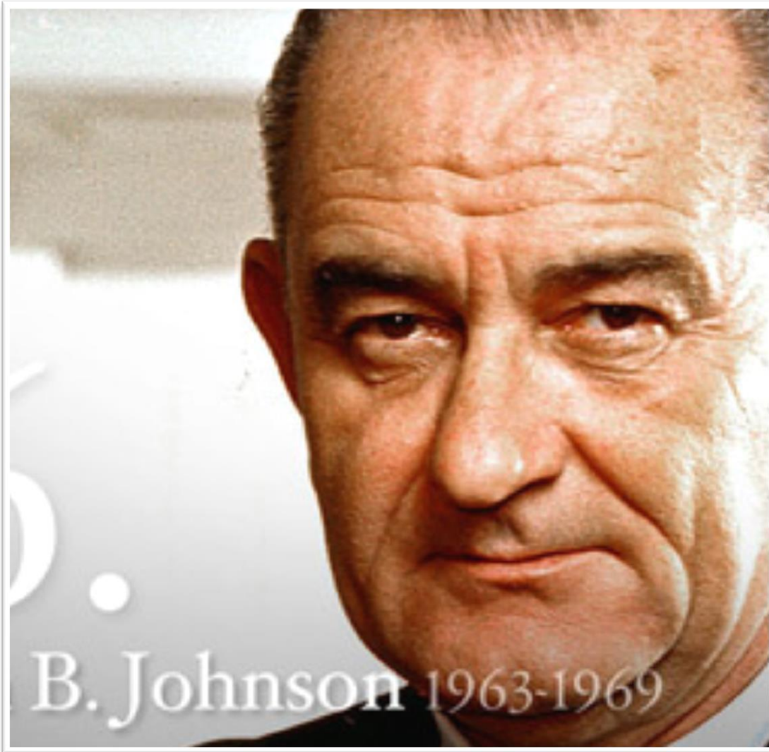
President Lyndon B. Johnson